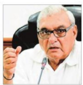
Promises to raise demands of various unions in House

He met the "Delegates of employees' union/Retiree Welfare Association, Yapur Mandi, ASHA workers and Anganwadi workers, who submitted a memorandum regarding their demands. He promised to take up their demands in the next Assembly session.